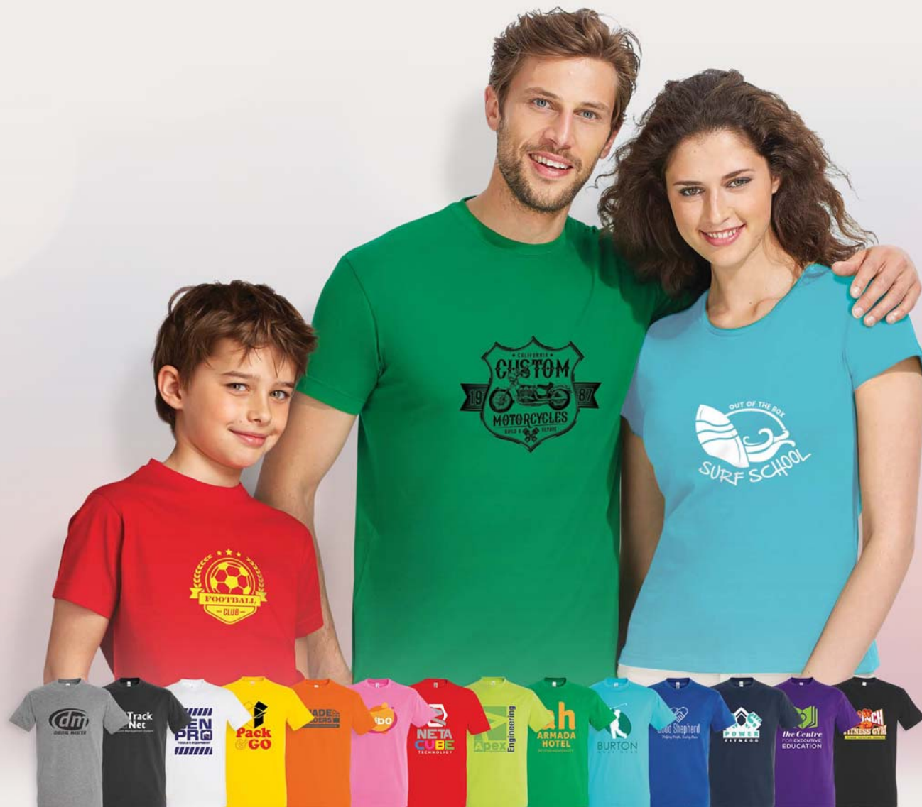
110760 - Sols Imperial Adults T-Shirt