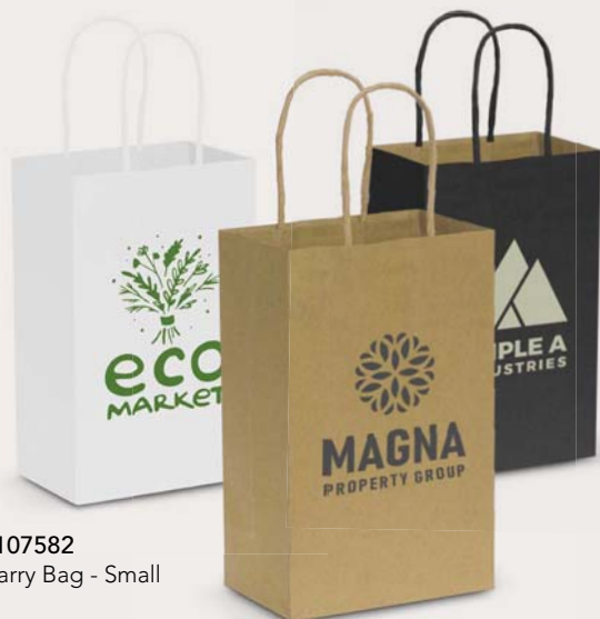
107582 Paper Carry Bag - Small