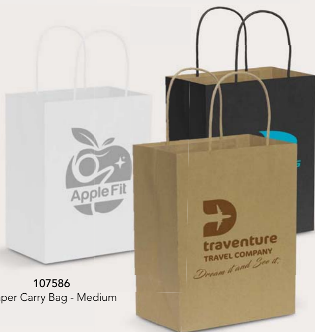
107586 Paper Carry Bag - Medium