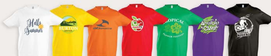
110659 - Sols Imperial Kids T-Shirt