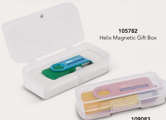
105782 Helix Magnetic Gift Box