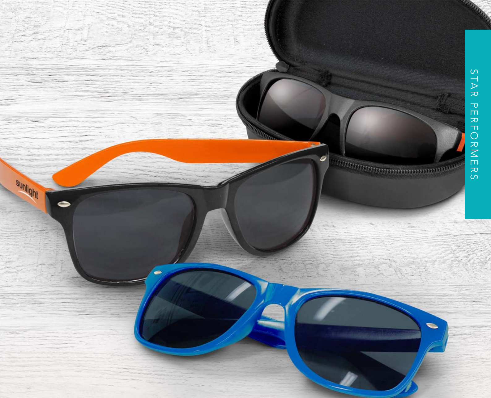
109772 - Malibu Premium Sunglasses