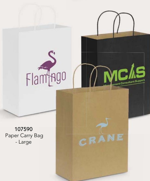
107590 Paper Carry Bag - Large