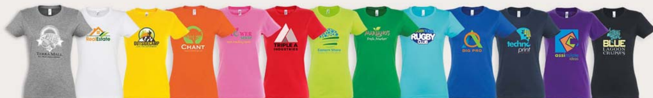
110658 - Sols Imperial Womens T-Shirt