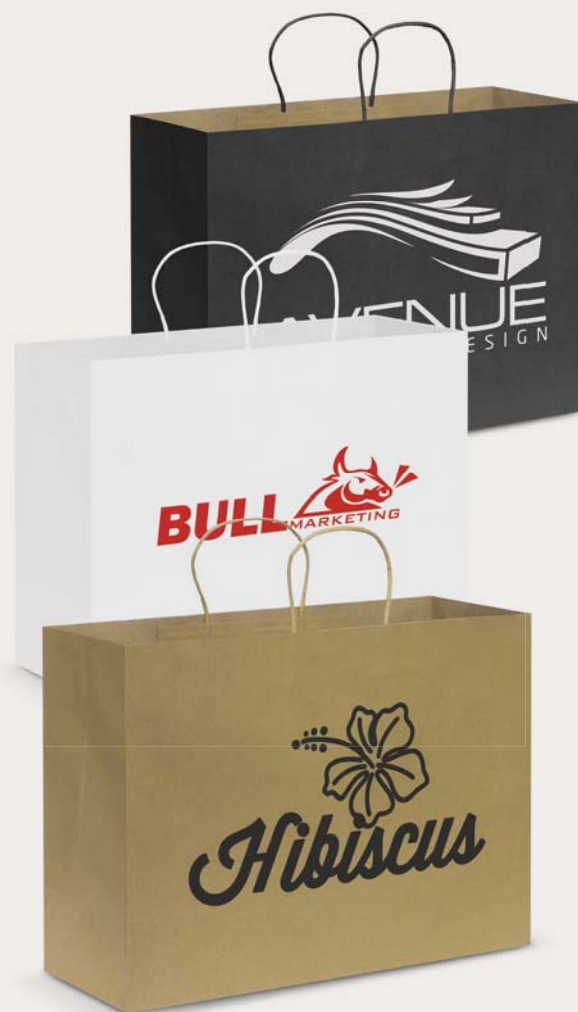
107594 Paper Carry Bag - Extra Large