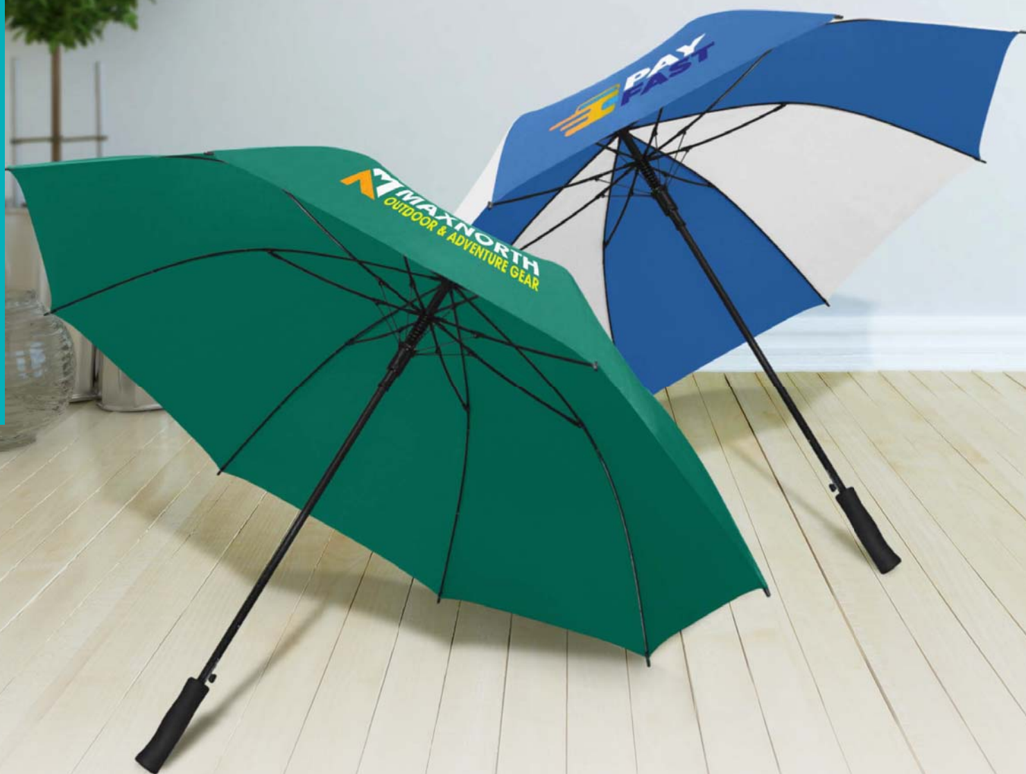
110485 - Hydra Sports Umbrella - Colour Match