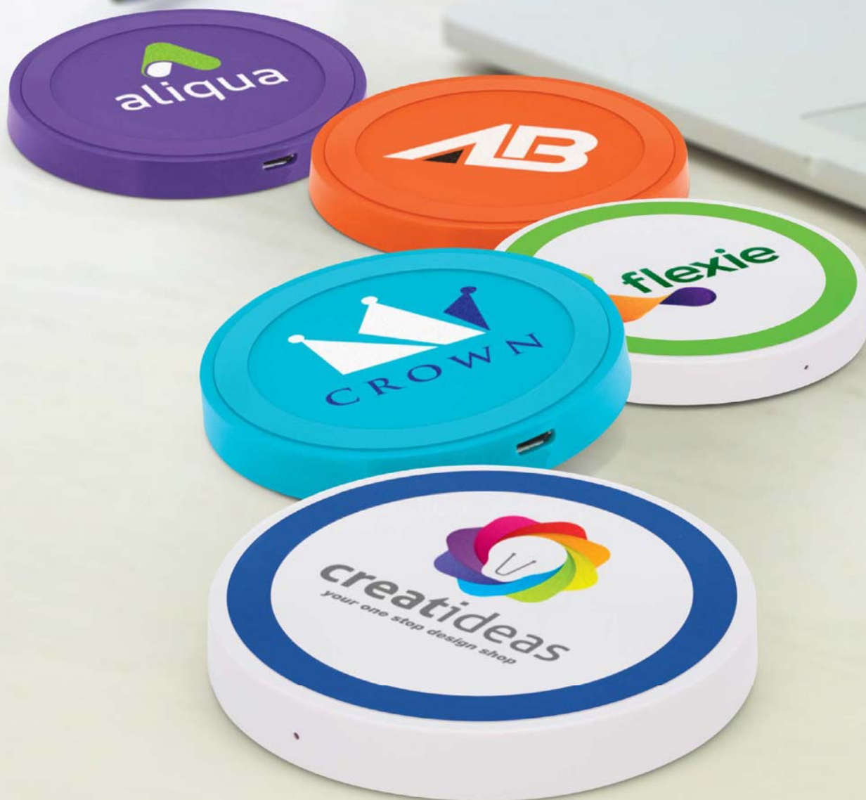
112656 - Orbit Wireless Charger - Colour Match